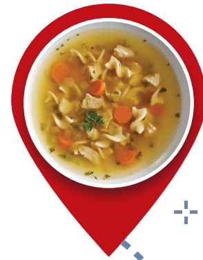
27443 Campbell's® Signature Healthy Request® Reduced Sodium Chicken Noodle