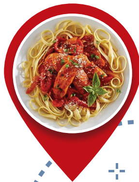
Chicken Cacciatore featuring 27444 Campbell's® Signature Reduced Sodium Tomato Basil Soup